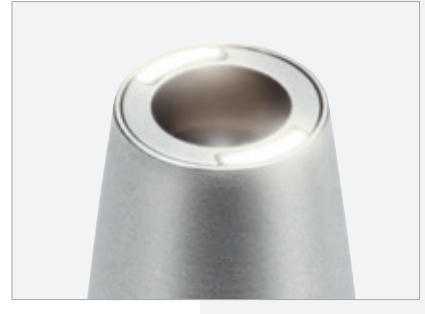
Large optic outlets

The powerful, controlled deployment of the power can be adjusted to suit the application in question using the power regulator.