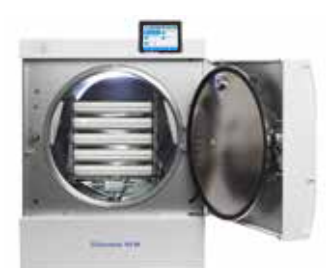
15 MELAstore-Boxes 100