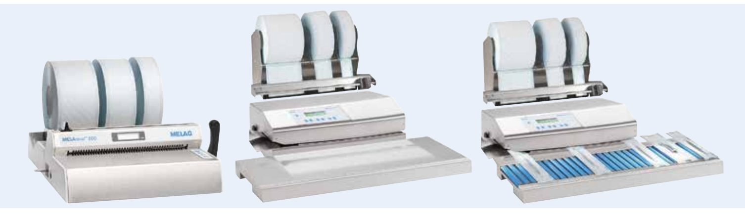
MELA seal 200 with the practical roll dispenser "standard"