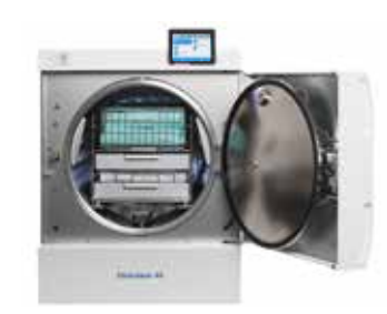
An instrument basket and two trays