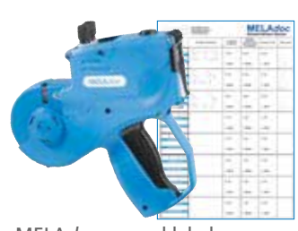
MELAdoc manual label printer and documentation

then we recommend the manual MELA doc label printer and the MELAdoc documentation. The labels are affixed to the sterilization packaging and serve the labelling and approval. They provide information regarding the sterilization date and expiry date, identify the person issuing approval and the batch number.