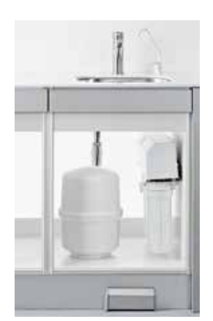
MELA dem 47 fitted in the floor unit, with removal valve and storage container