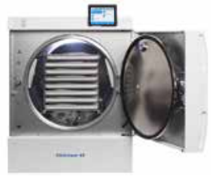
24 dental trays