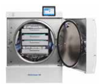
Four trays (30 x 5 x 59 cm)