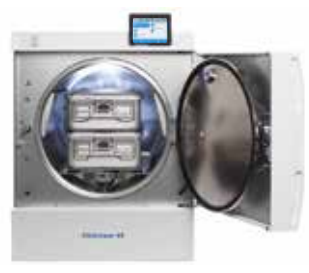
Two half containers (each 30 x 15 x 60 cm)