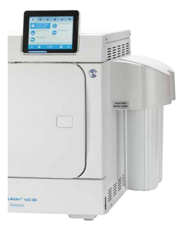
MELA dem 40, fitted laterally to the steam sterilizer