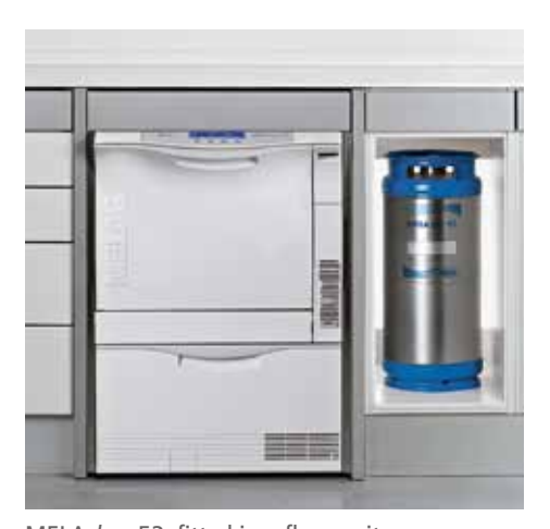
MELA dem 53, fitted in a floor unit