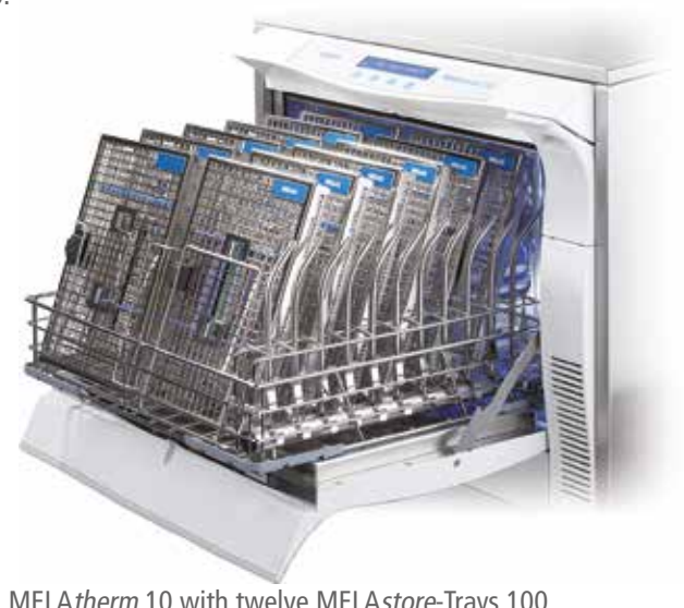
MELAtherm 10 with twelve MELAstore-Trays 100