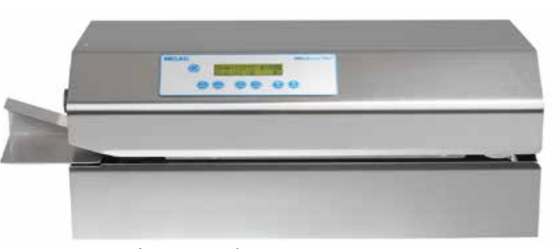
MELAseal Pro rotary sealer