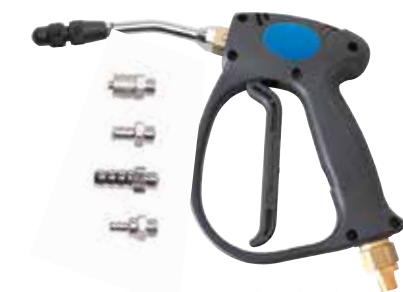
MELAjet spray pistol with adapters

The MELAjet spray pistol enables removal of demineralized water for other purposes.