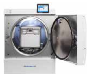
A sterilization container (30 x 30 x 60 cm)