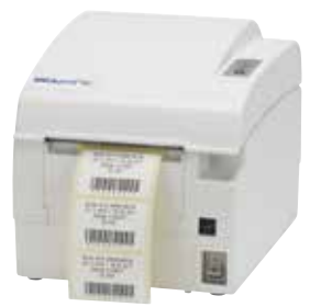
MELAprint 60 label printer for the printing of labels

The practical hand scanner enables the transfer of the data into the digital patient documents.