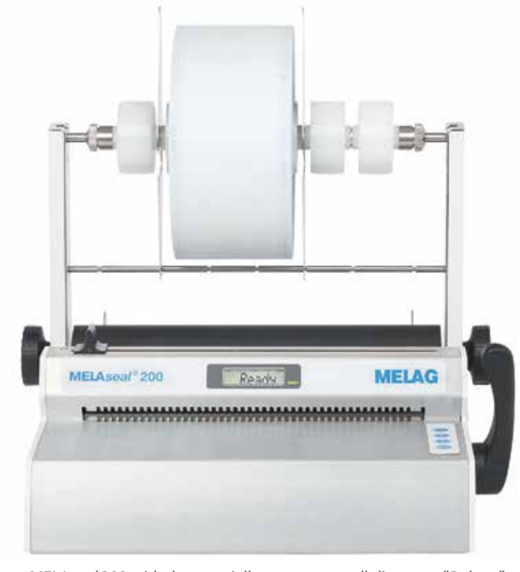
MELAseal 200 with the especially easy-to-use roll dispenser "Deluxe"