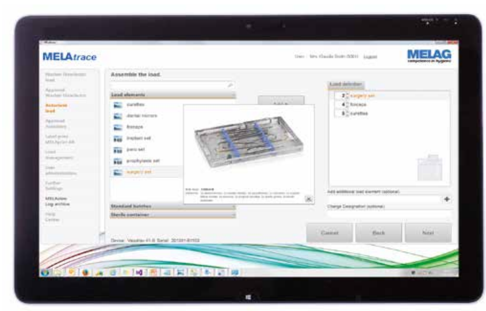
Determine the loading of the washer-disinfector and steam sterilizer